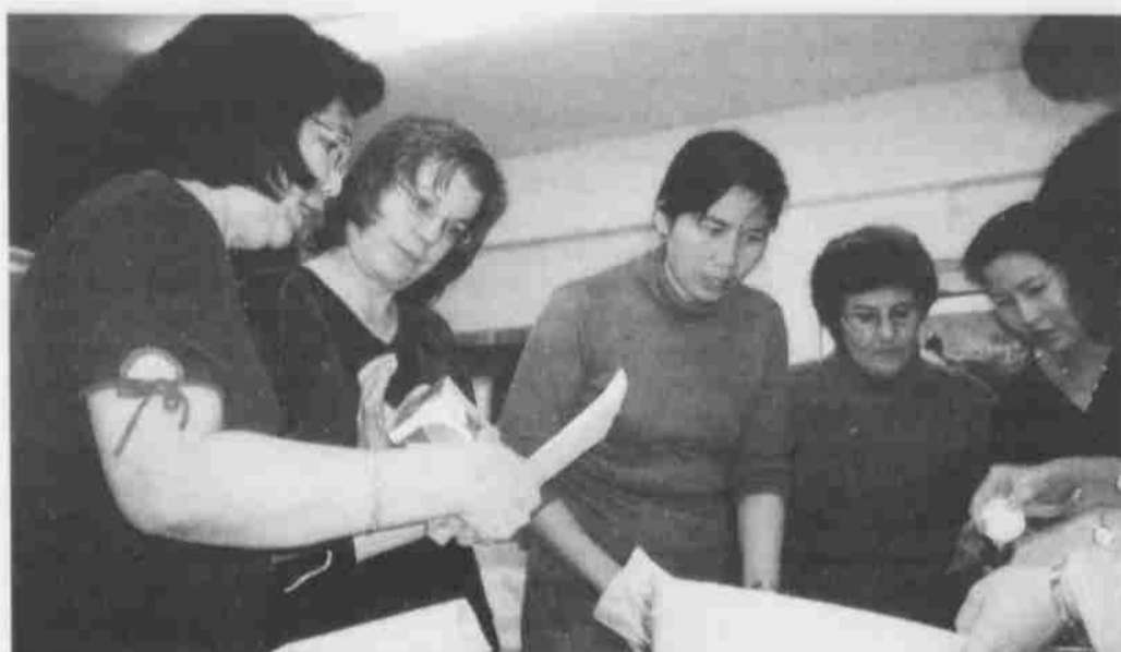
Members of the ESL Learning to Cook Canadian Food class gathers for another lesson on typical North American menu items

munities is a group that works within the 10 downtown neighborhoods helping average people put ideas to improve health, well being and community into action. Action for healthy communities helped the students in the ESL class find resources and gave them a grant for their supplies.