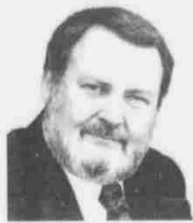
Peter Goldring, Member of Parliament Edmonton Centre-East

For the first time in its 90 years of serving Edmonton's needy, the Bissell Centre is in need of our help. It has appealed to the public for donations. The shortfall is comparatively small - a $150,000 deficit on an annual budget of $2.5 million. Since the mid-January announcement of the