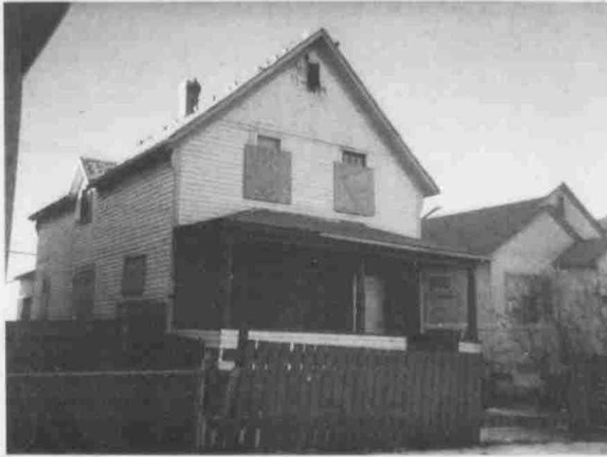
The "pigeon house" at 10612-96 St., vacant and boarded up, is home to numerous pigeons.