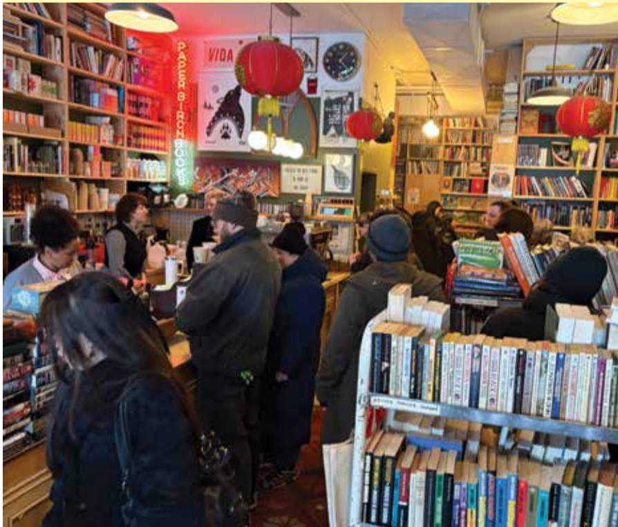
Paper Birch Books had its busiest Independent Bookstore Day thus far on April 25th, with over 400 transactions. There was also a pop-up at Felice Cafe featuring a couple of independent booksellers.