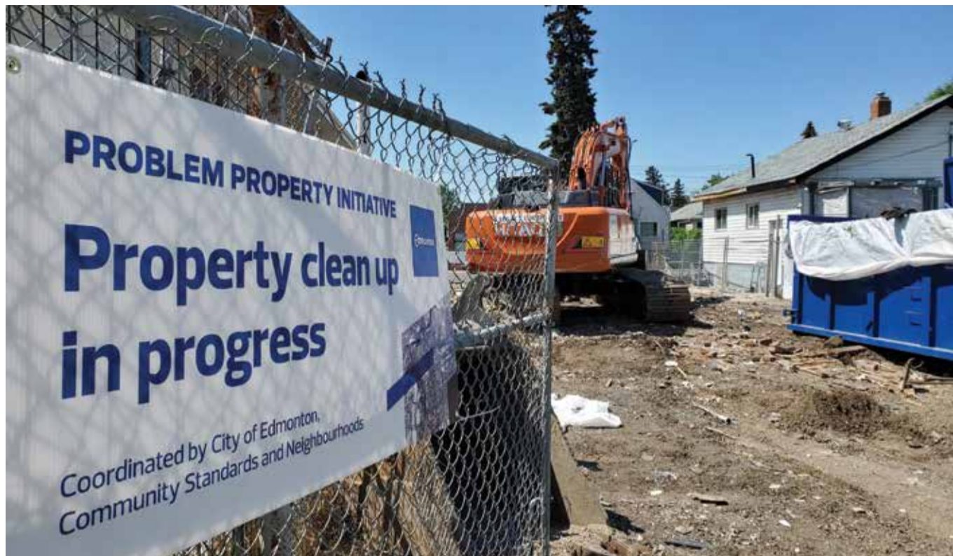
A derelict residential lot in the process of being cleared and remediated. Such sites are addressed by the Problem Property Initiative (PPI) to eliminate local safety hazards and help restore community well-being. City of Edmonton

The PPI is a coordinated City response, bringing together multiple teams focused on inspections, enforcement, and ordering property remediations and demolitions.