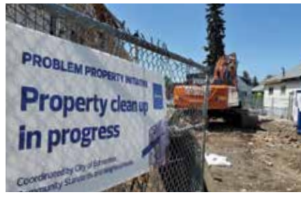
EDMONTON'S PPI TURNS THREE ▲ 9