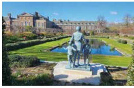
A CREATIVE ADVENTURE ▲ 7