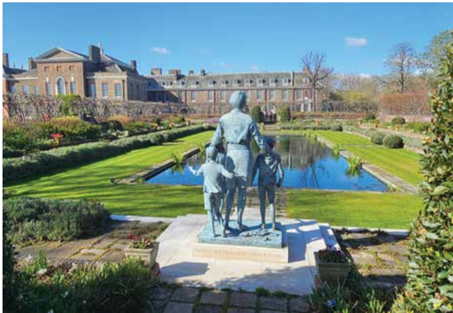
Kensington Palace with a rear view of a statue of Princess Diana with Prince Harry and Prince William.

When I told Canadian friends I was off to London, they often asked which one. In London, England, though, Edmonton is a suburb where a Hudson’s Bay Company executive was