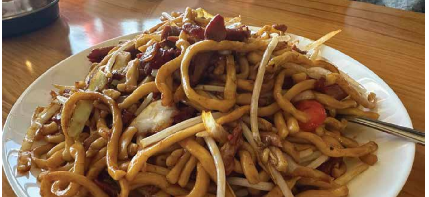
Shanghai Noodles at 7-Kitchens Restaurant. Alan Schietzsch

tensive with familiar Chinatown dishes: fried rice, chow mein, noodle soups, combination platters, sweet-and-sour favourites, seafood dishes, and family dinners designed to feed far more people than advertised. There are also house specialties and combination meals that make the restaurant particularly appealing for budget-conscious diners or big families.