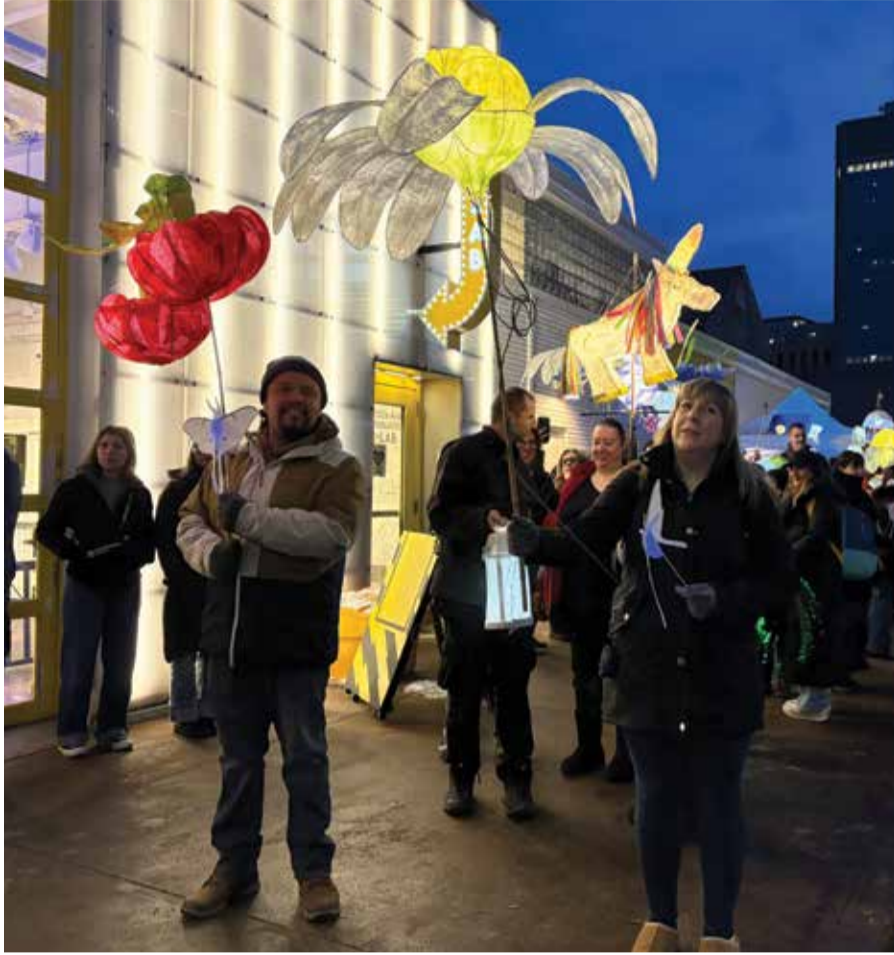
Participants at the start of the MARCH Equinox Illumination lantern parade at CO*LAB on March 21st. Formerly known as GLOW, this event, now in its tenth year, celebrates the coming of spring.