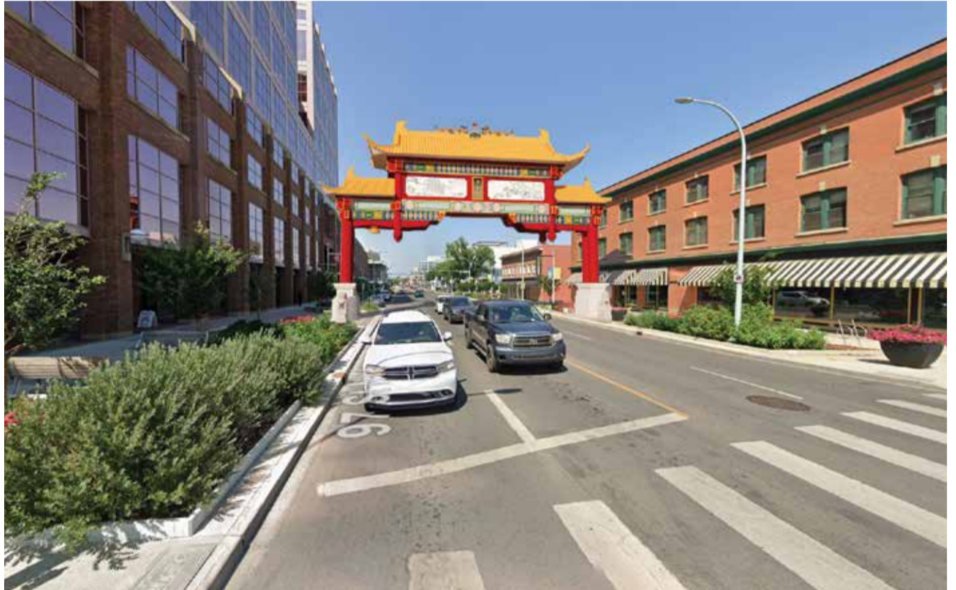
A rendering of the new Chinatown Gate.