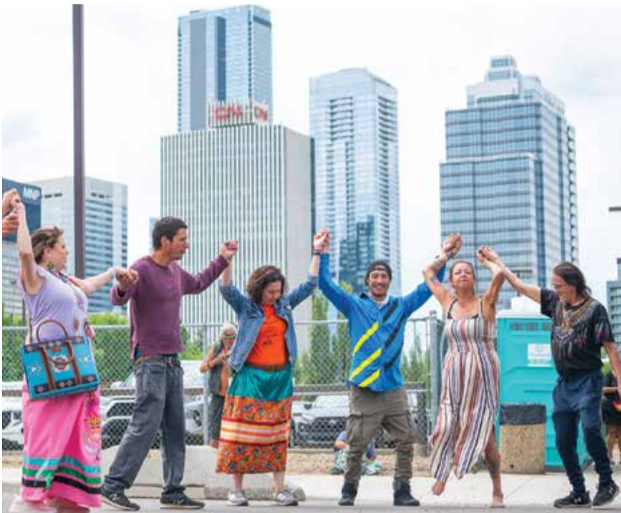
A moment from Bissell Centre's NIPD celebration in 2025. Bissell Centre

One of Bissell Centre's largest and most joyful celebrations of the year is coming back with even more performers, food, activities, and cheer for the whole community.