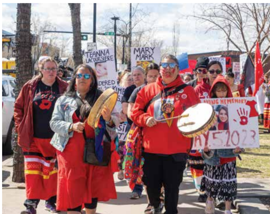
Red Dress Day is an annual event on May 5th to commemorate missing and murdered Indigenous women, girls, and Two-Spirit people. Top: One march took place along Jasper Avenue to the Legislature. Bottom: Later in the day, another march took place along 118th Avenue between 92nd and 86th Streets.