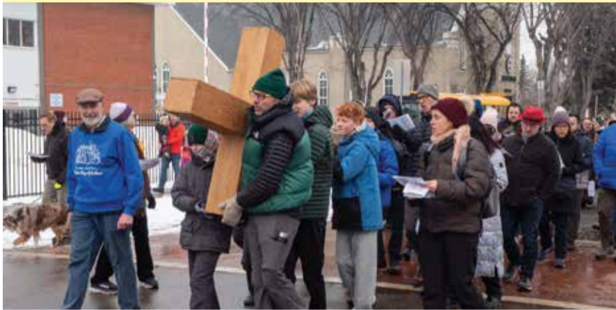
The 46th Annual Good Friday Outdoor Way of the Cross happened on April 3rd. It began and finished at Sacred Heart Church of the First Peoples. This annual event discusses social justice issues in an ecumenical faith context. This year's theme was: Whatsoever You Do: Seeing, Naming and Protecting the Rights of People as Part of Creation.