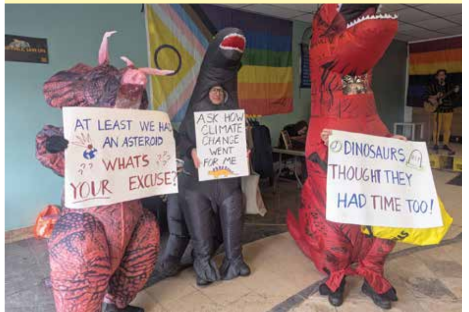
The Joyful Dinos protest group appeared at the Earth Day Block Party hosted by Earth's Refillery Coop on April 26th. The event featured music, workshops, an eco-market, and other activities.